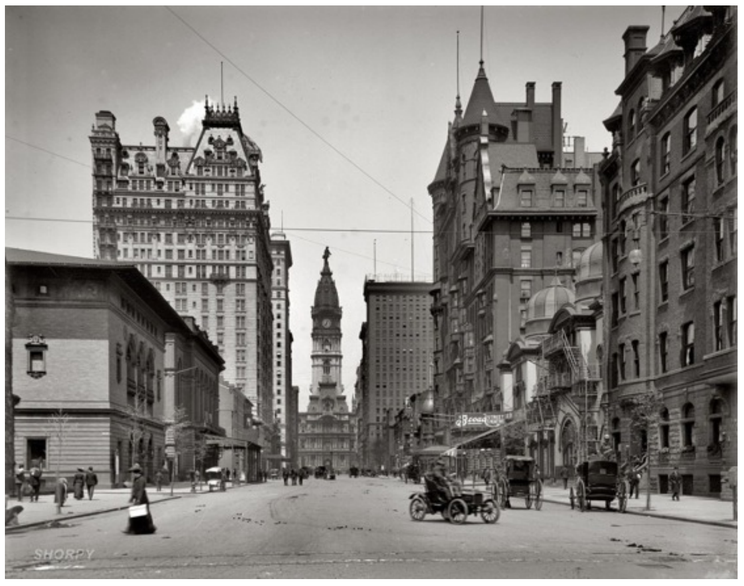
Broad Street north of Spruce Street, Philadelphia, 1905.