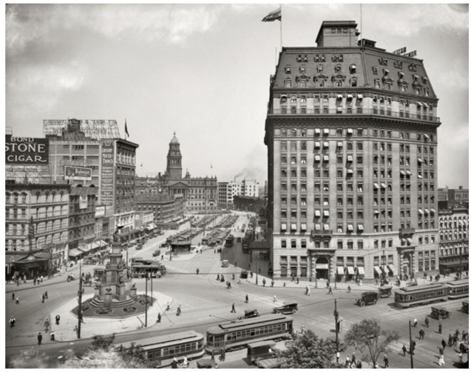
Cadillac Square, Detroit, Michigan, 1916.