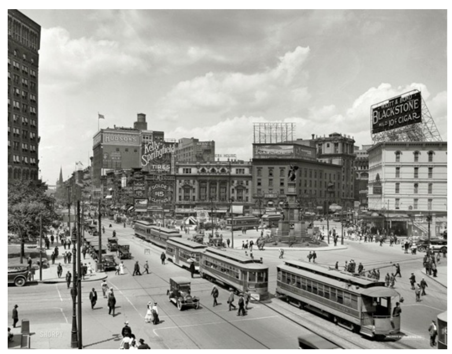
Woodward Avenue, Detroit, Michigan, in 1917.

Developing was another tedious task during which they had to be careful not to break the glass!