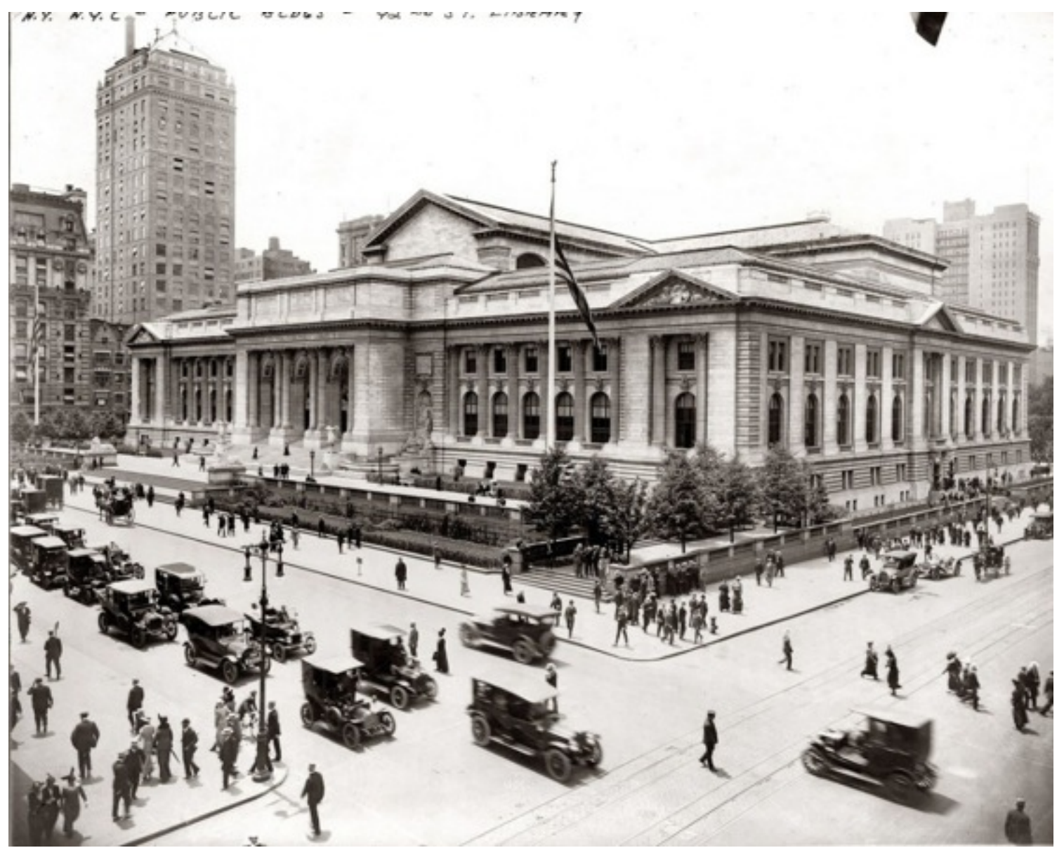
The New York Public Library, New York, 1915. Didn't realize they had 4-laners in those days.