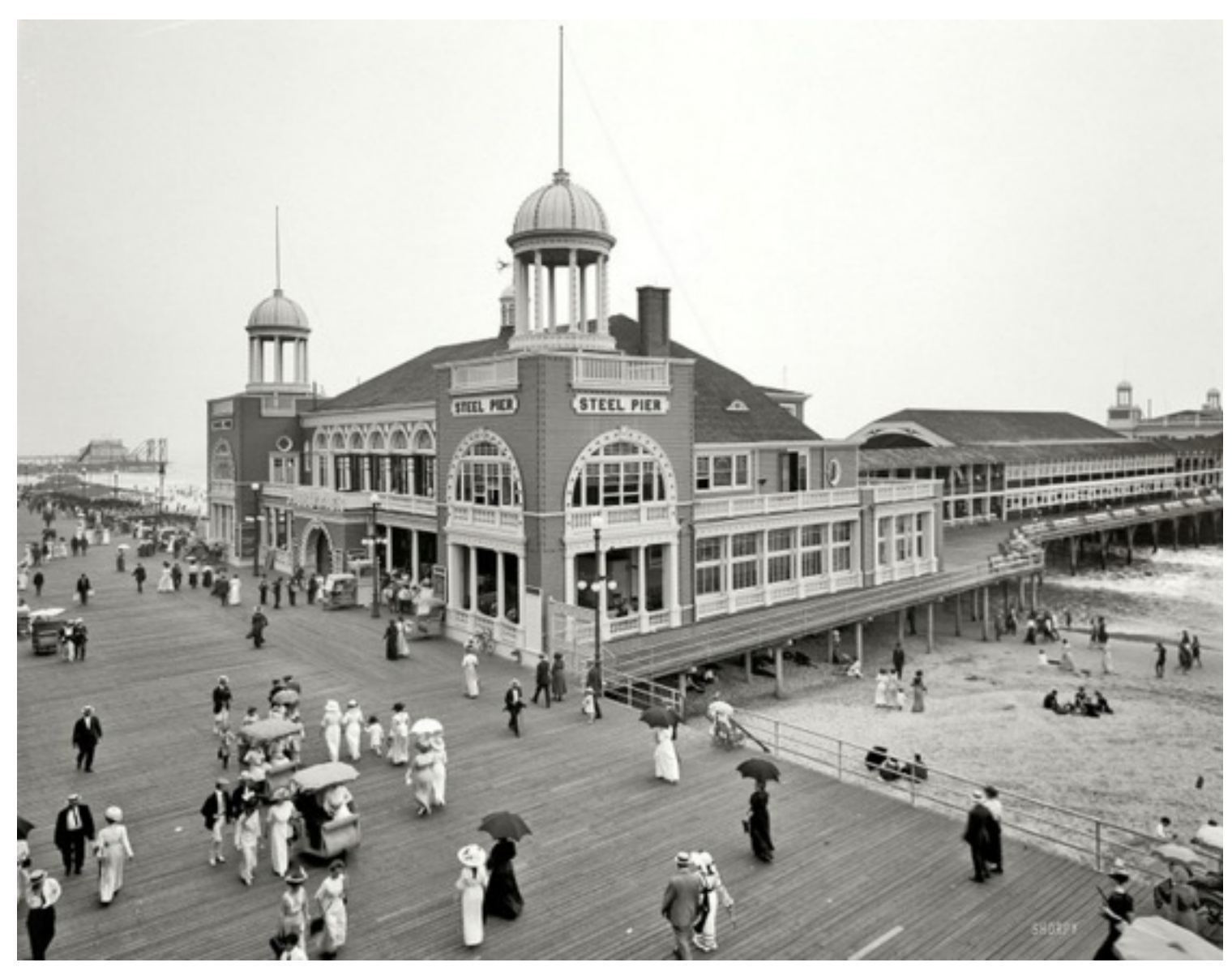
Atlantic City, 1910