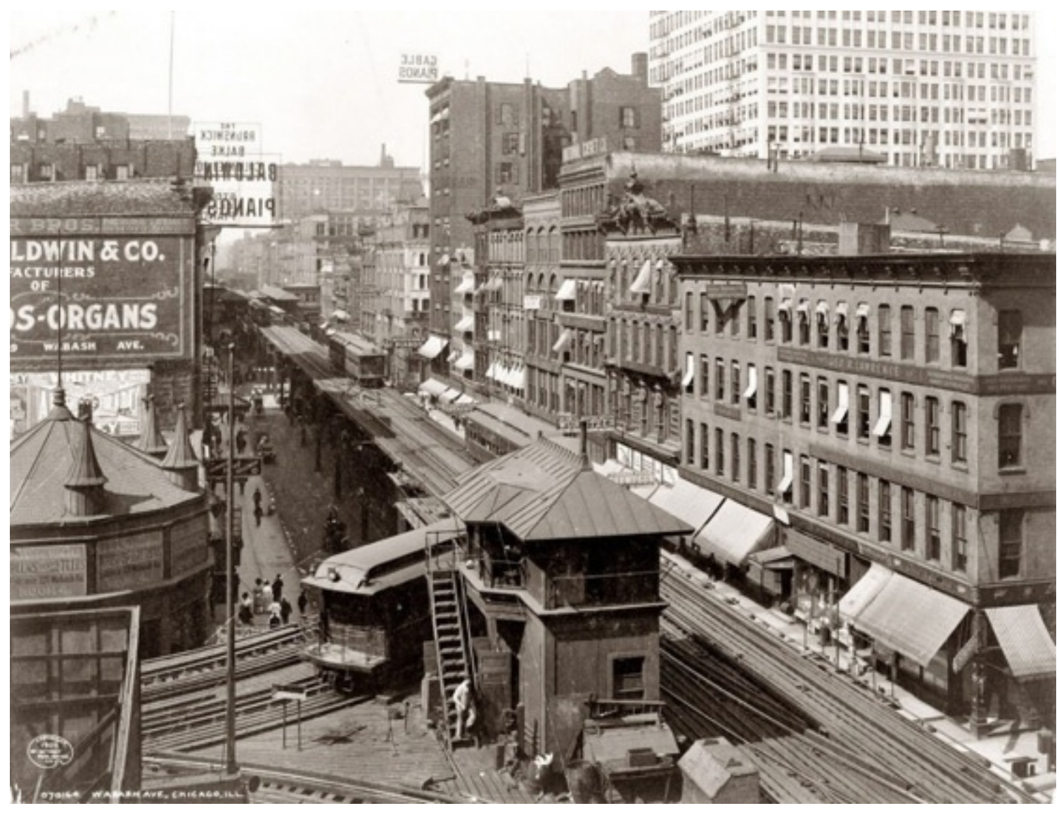
Wabash Avenue, Chicago, 1907.