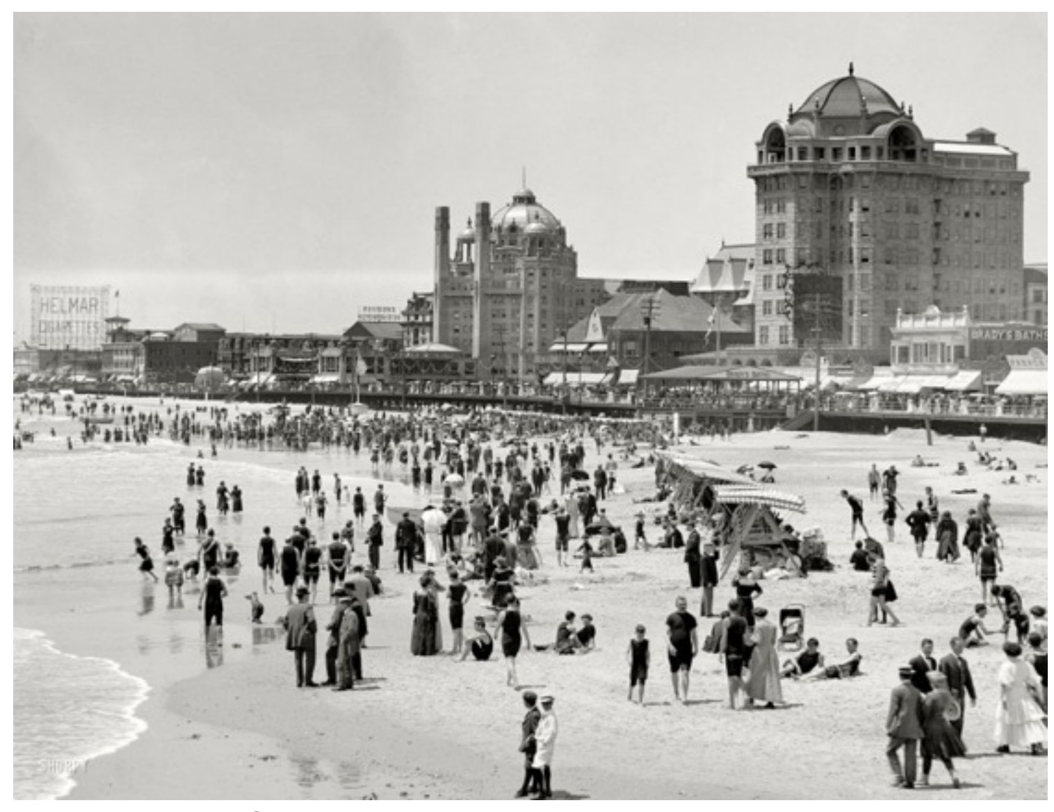
The beach in Atlantic City, 1915. Note the men in coats and ties.