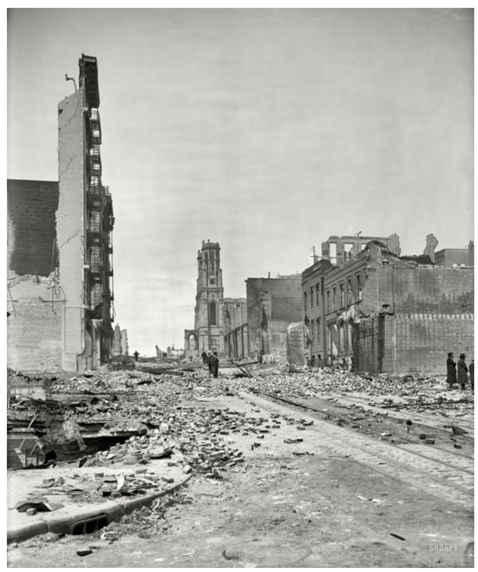
Grant Avenue after an earthquake in San Francisco in 1906.