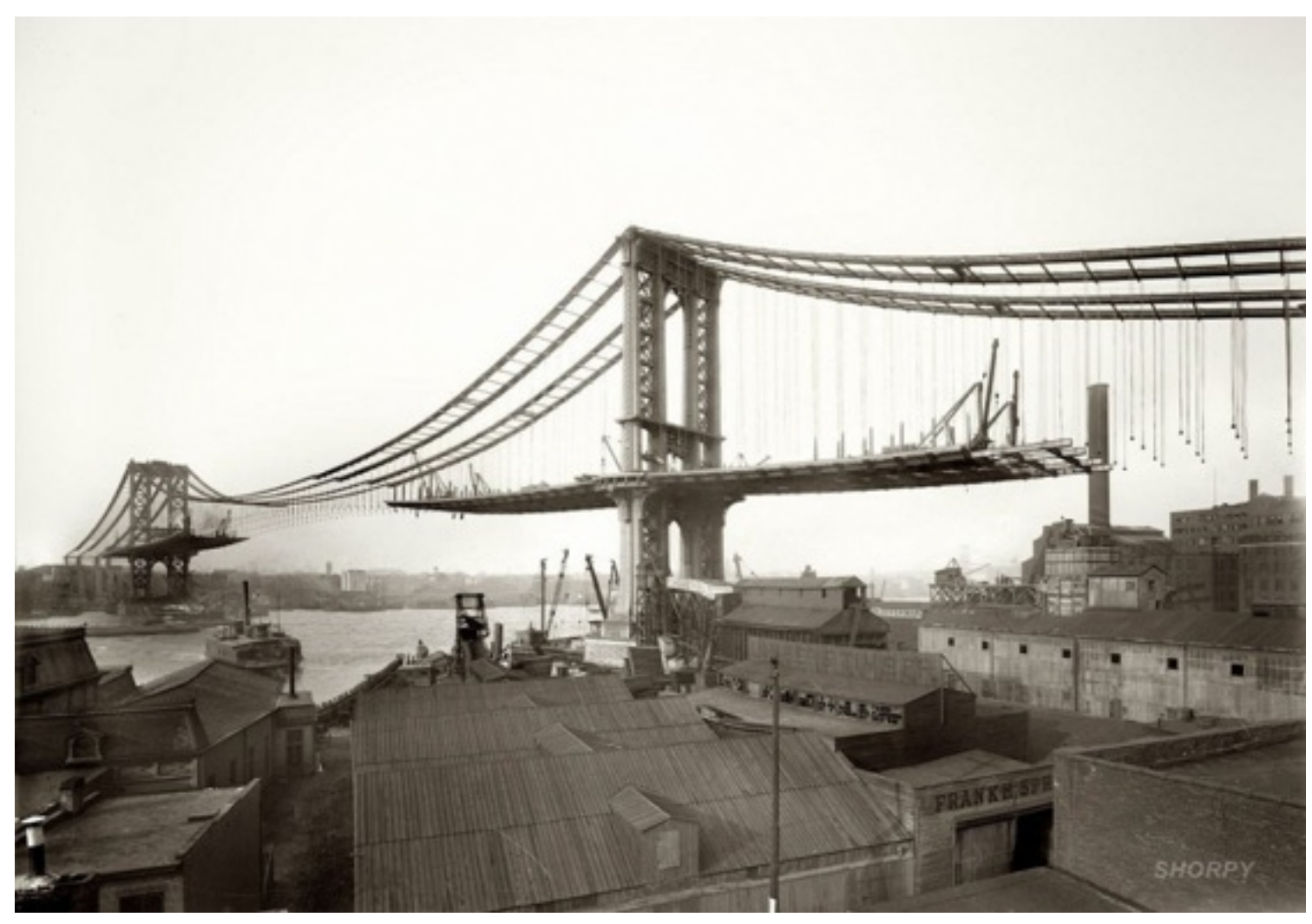
View of Manhattan Bridge from Brooklyn in 1909.