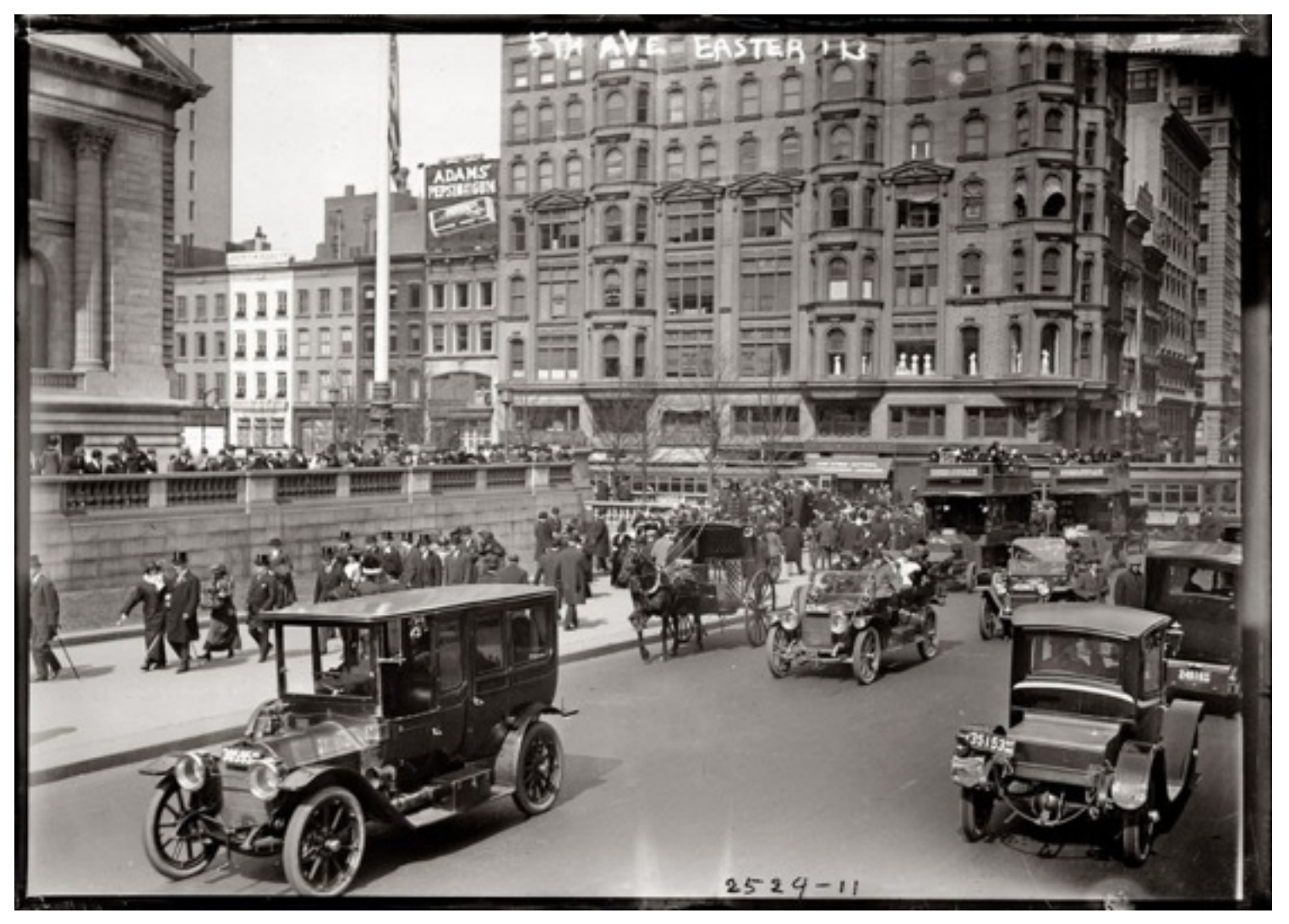
Fifth Avenue, New York, 1913. Look at those top hats!