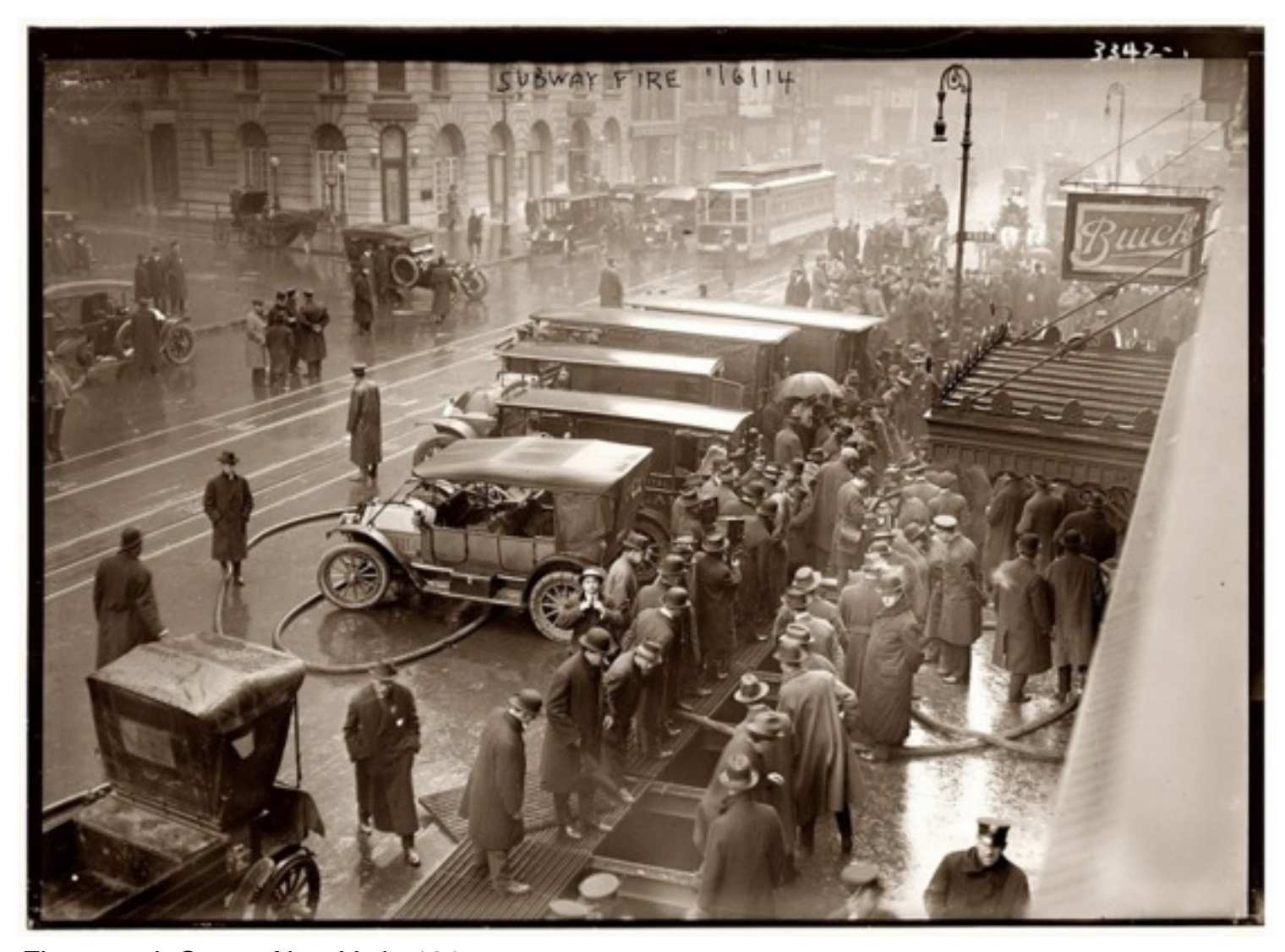
Fire at 55th Street, New York, 1915.