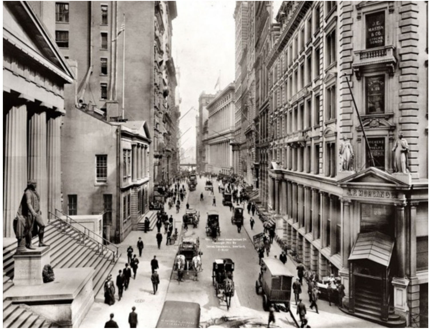
Wall Street, New York, 1911. The 2 sidewalks together are as wide as the street in this pic.