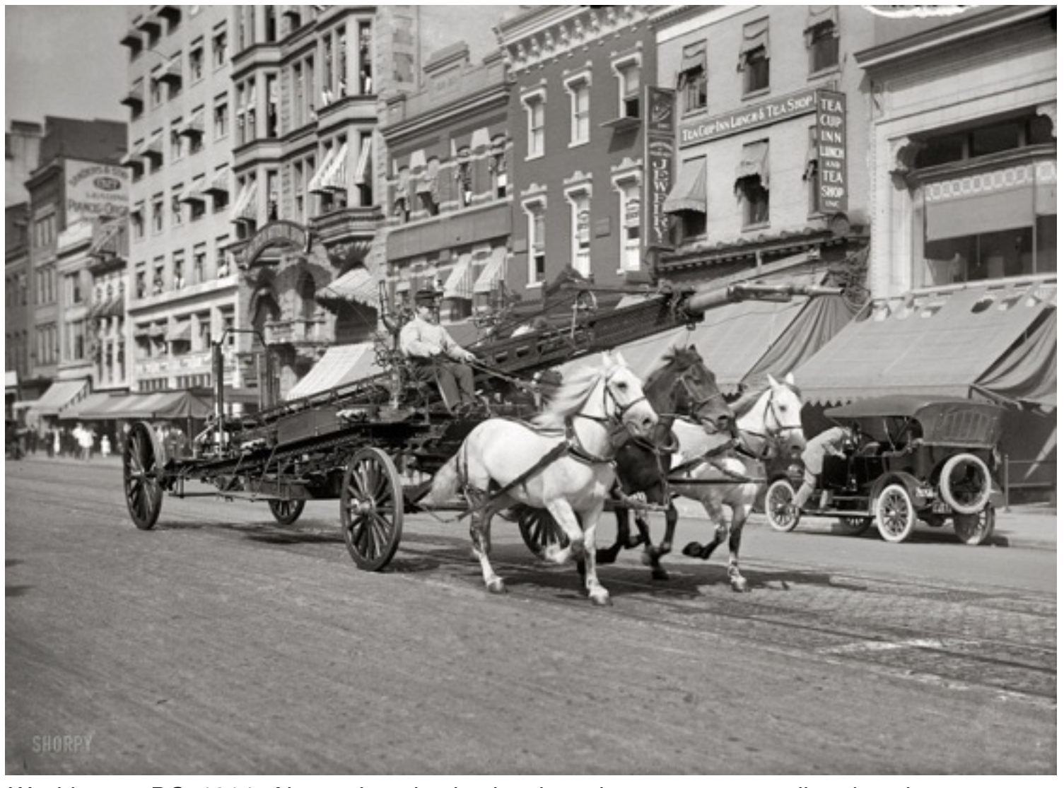
Washington, DC, 1914. Not so thoughty having those horses run on a railroad tracks. (thoughty? must have been a popular word back in the day) (note the people in the windows)