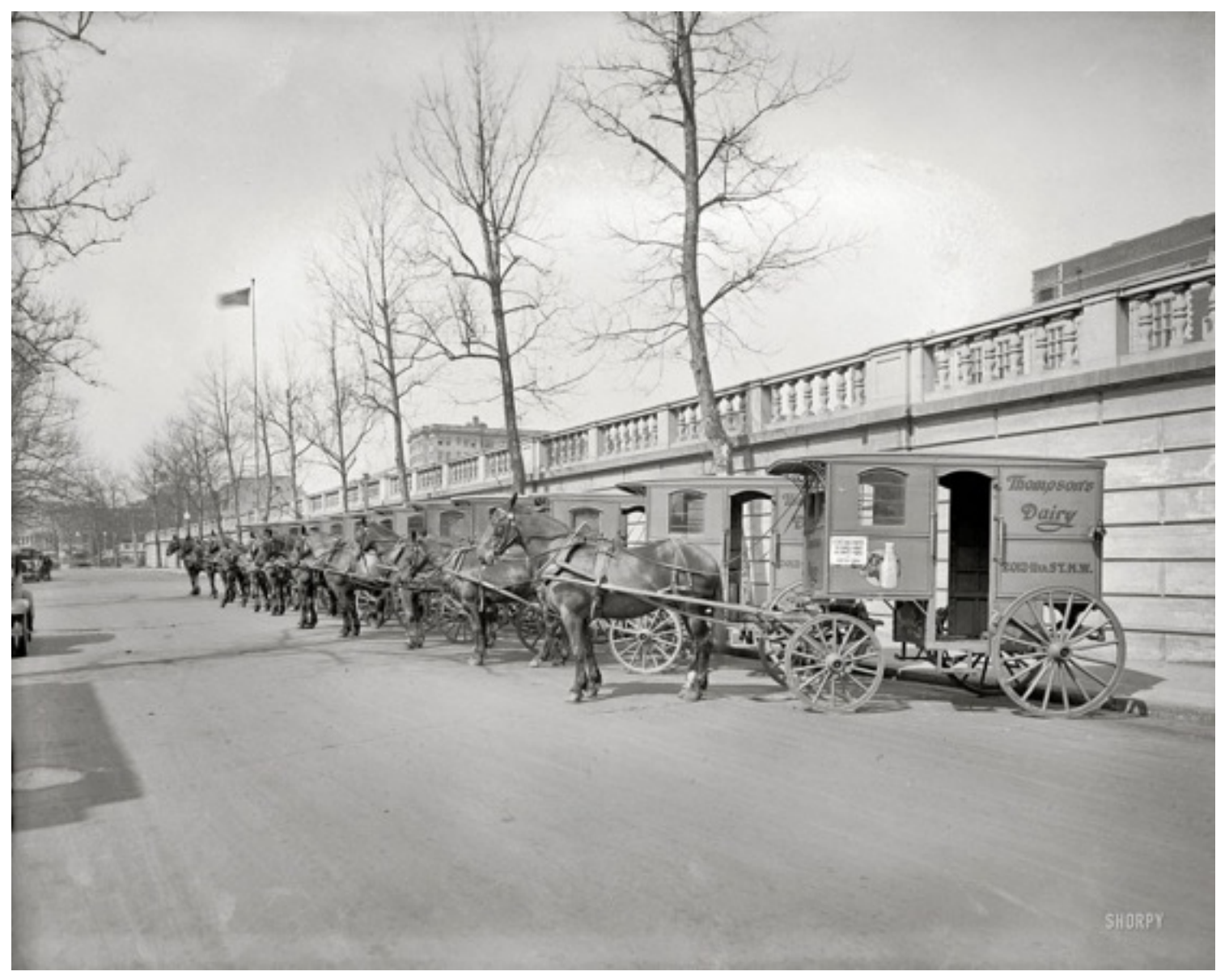
Carts for transporting dairy Thompson, Washington, 1927. How in the world did the dairy get those horses so evenly lined up. (Washington County, Wisconsin?)