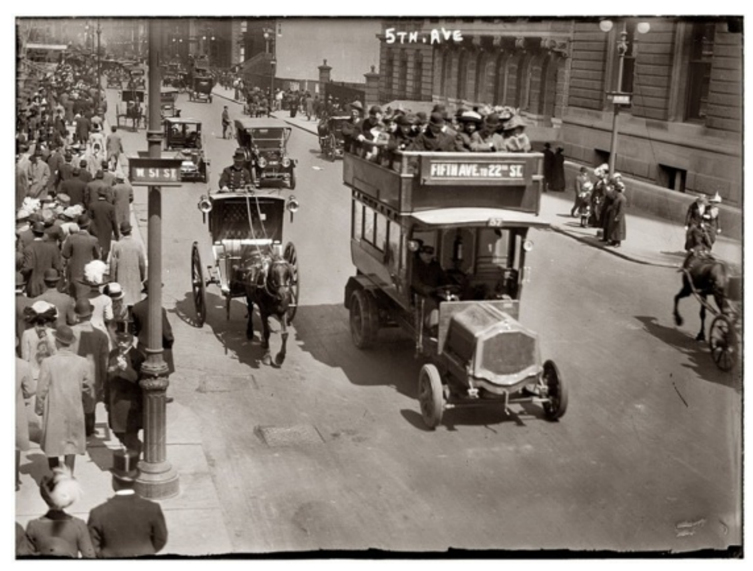
Fifth Avenue, New York, 1913.