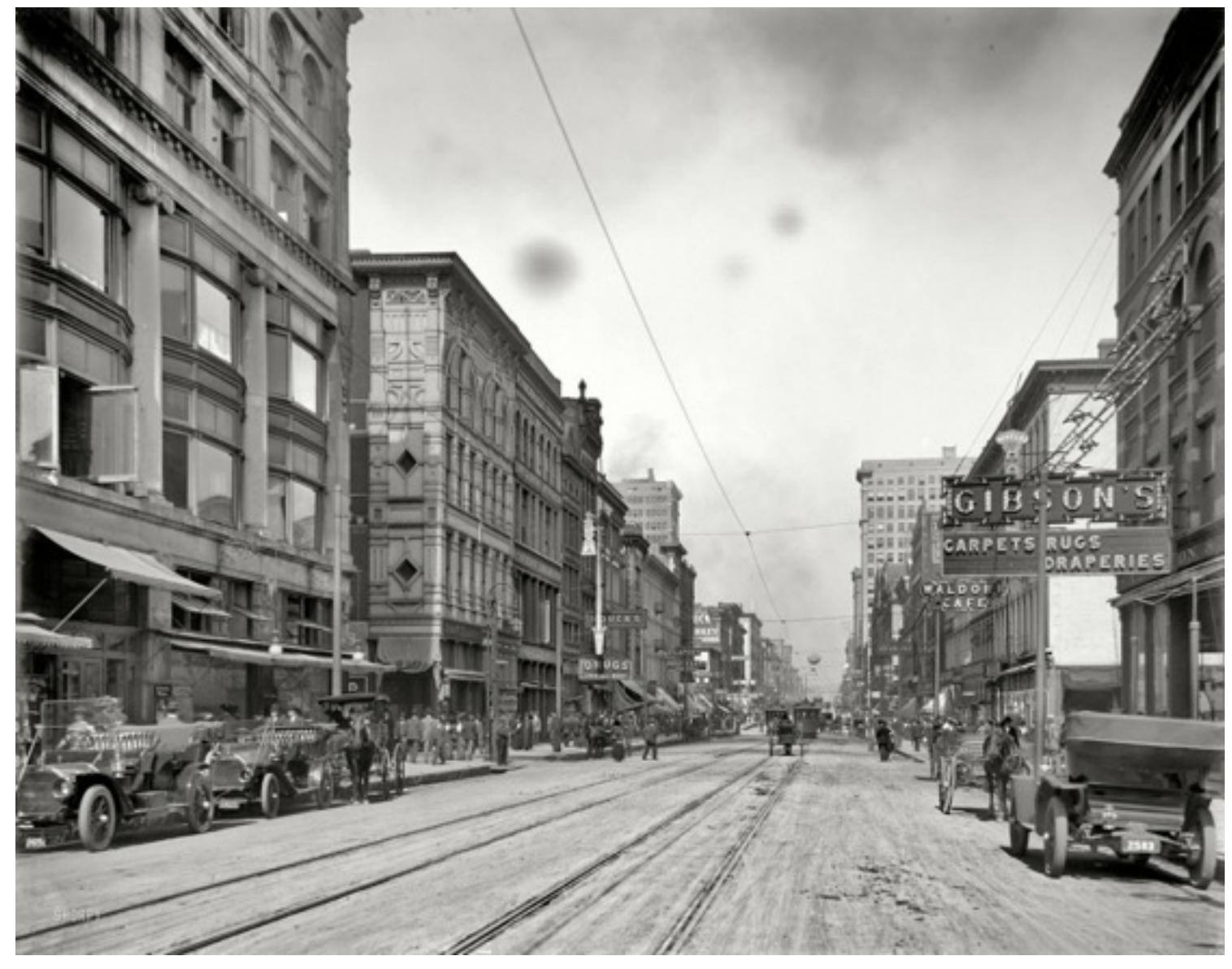
The main street of Memphis, north of Avenue Gayoso, 1910.