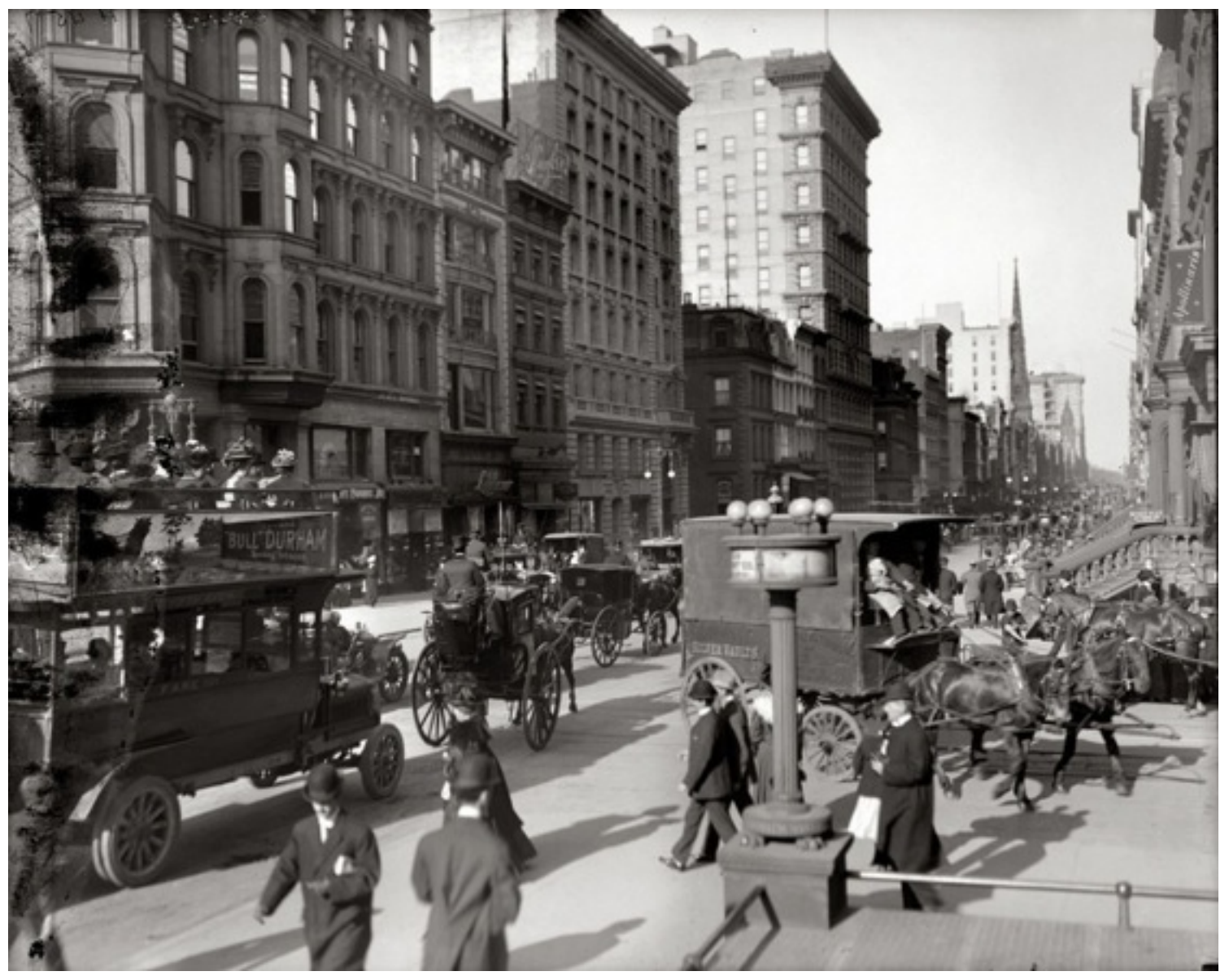
Corner of Fifth Avenue and 42nd Street, New York, 1910.