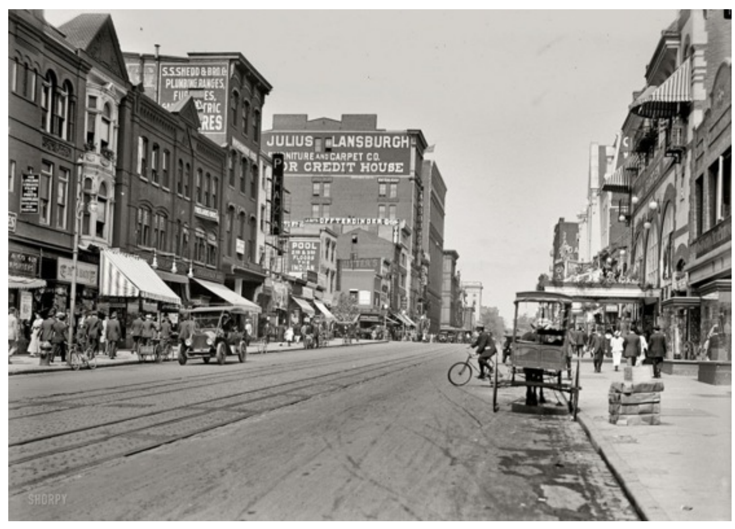
Ninth Street, Washington DC, 1915.